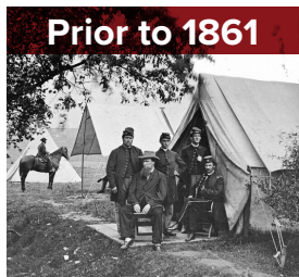
Prior to 1861

Each state maintained its own militia, with limited Federal direction guidance or regulation. All able bodied men of military age (18-45) would enroll with very lax requirements. Citizen's willingness to serve was given priority over liability.