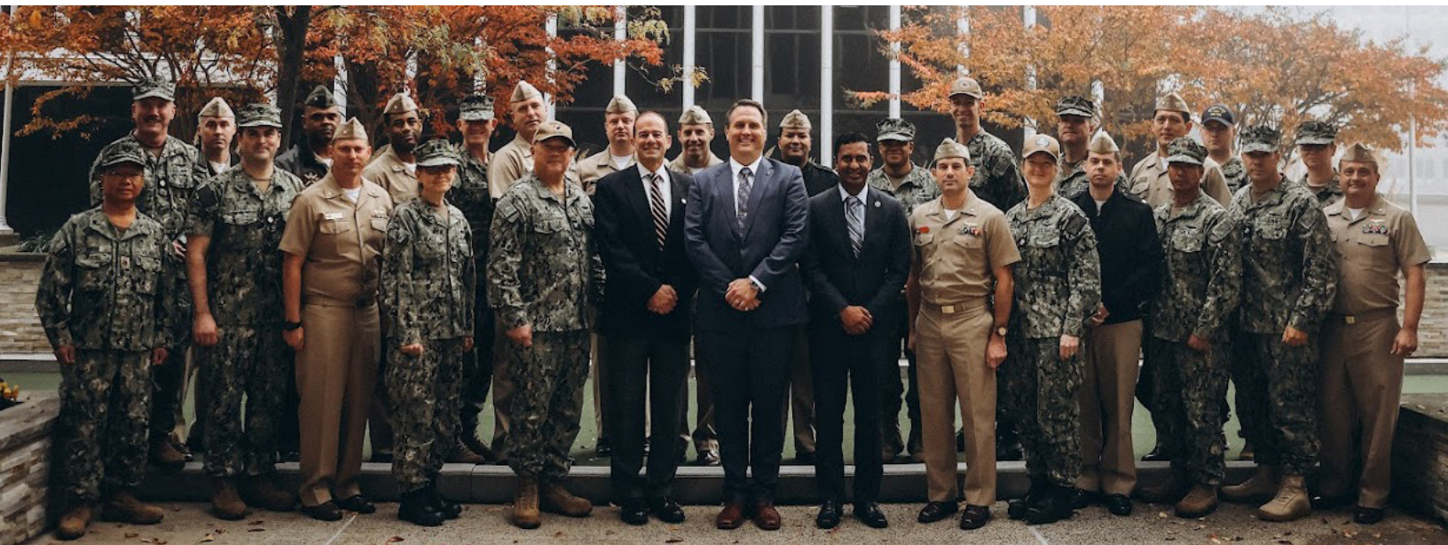
Selective Service Leadership with Navy Officers

Professional meetings such as this are important, not only to keep personnel informed and current on their responsibilities to Selective Service and the U.S. Navy, but also to support the Director's Strategic Vision and Leadership Philosophy.