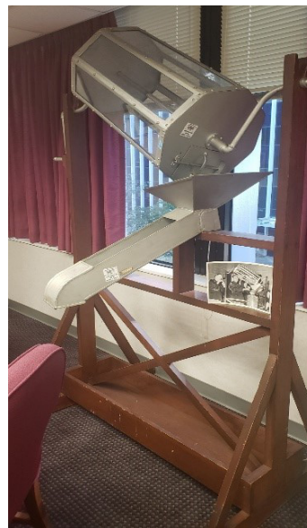
Lottery capsule tumbler machine