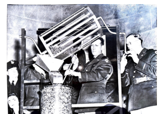
World War II lottery drawing using the lottery capsule tumbler machine.