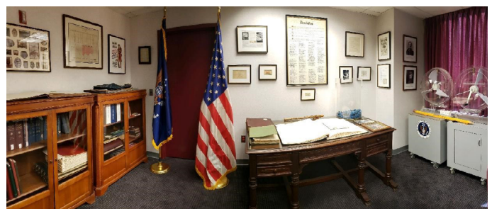
The desk of Major General Crowder that he used from 1917-19 is also on display in the SSS Museum.