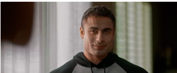
Stronger America PSA