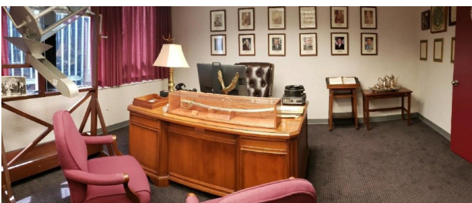
General Hershey's desk while Director of SSS.