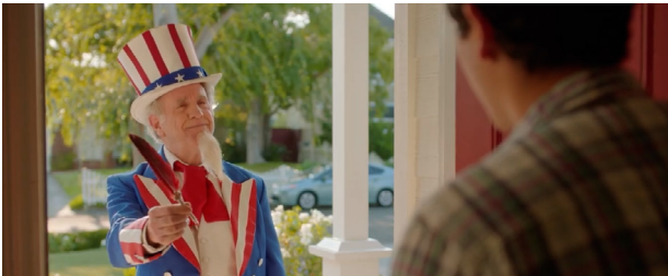
Uncle Sam PSA