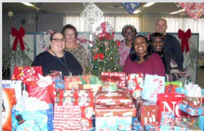
The Data Entry Section and Computer Support Branch.