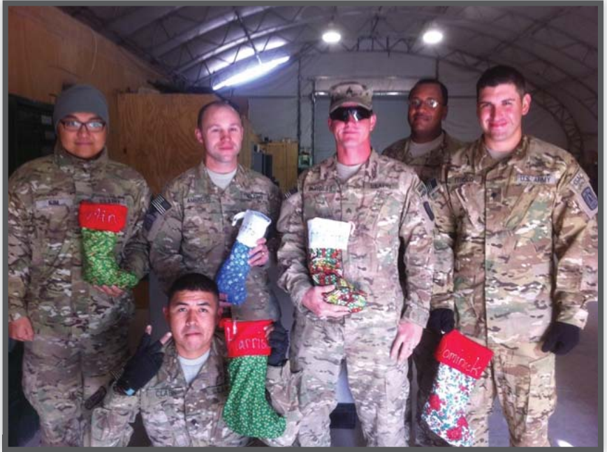
Troops enjoying their stockings

If you would like to learn more about Stockings for Soldiers, please contact the charity by phone: (302)475-2526 or online at: www.stockingsforsoldiers.org/