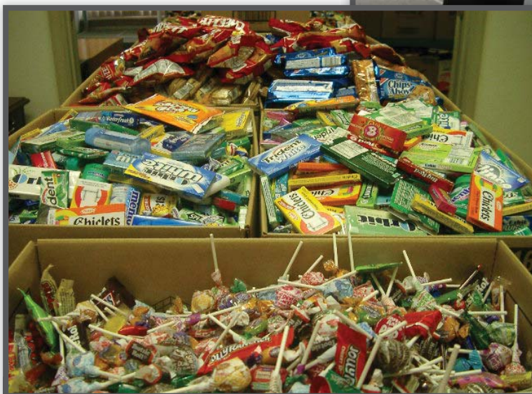
Goodies donated for the stockings