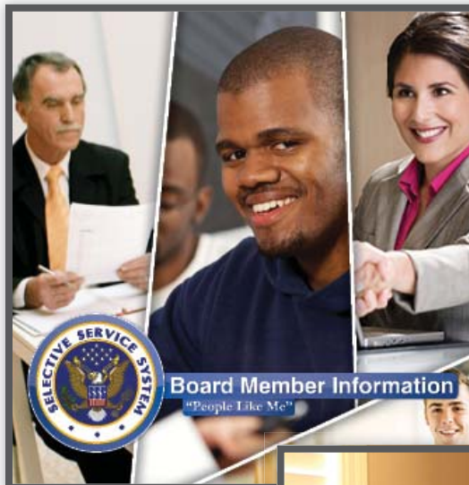
Board Member Recruiting Video Cover

Copies will become available in the next few months from either your supporting Region headquarters or by sending a request to information@sss.gov at National headquarters. ■