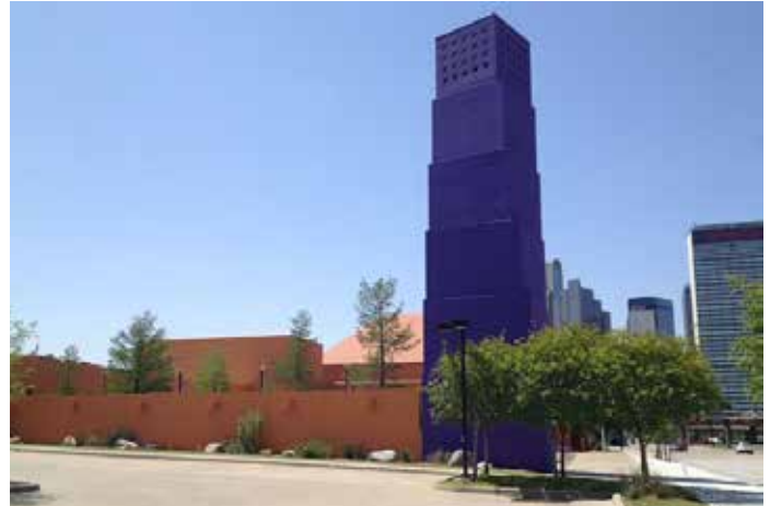
Pictured Above: Latino Cultural Center Dallas, TX