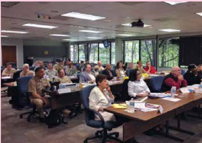
Pictured above is the Region II NOSD Class during IBMT With newly-appointed Georgia Board Members

Region II conducted New Officer/State Director Training at the Region II Headquarters during April 18-21, training newly-assigned Navy and Reserve Force Officers from Regions I, II, and III. Initial Board Member Training was held on Saturday and included the newly-appointed Georgia Board Members. Fifteen Reserve Officers and nine Board Members attended the class.