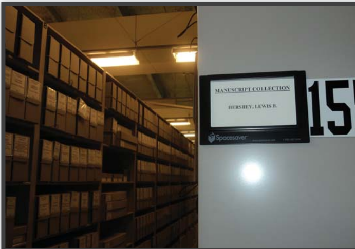
General Hershey Manuscript Collection