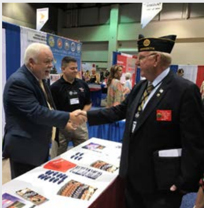
Greeting attendees at the SSS Exhibit Booth.