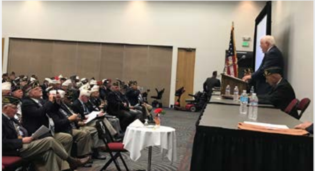
Director addressing the American Legion's National Security Committee.