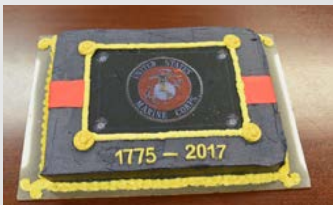
Marines Birthday Cake