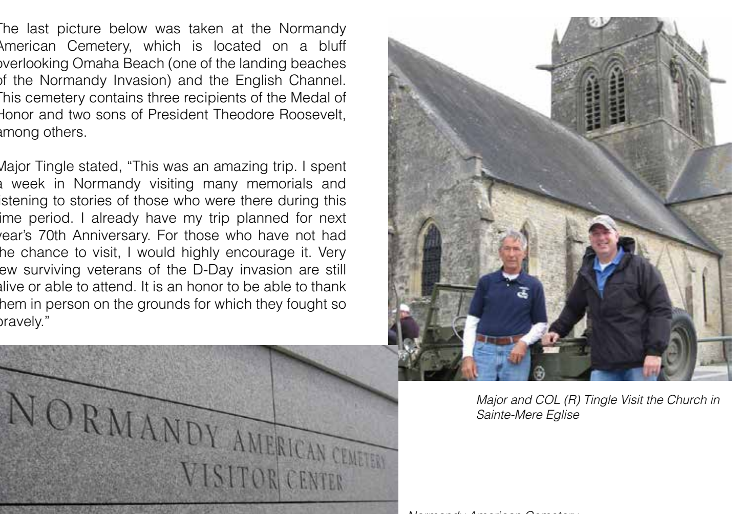
Major and COL (R) Tingle Visit the Church in Sainte-Mere Eglise