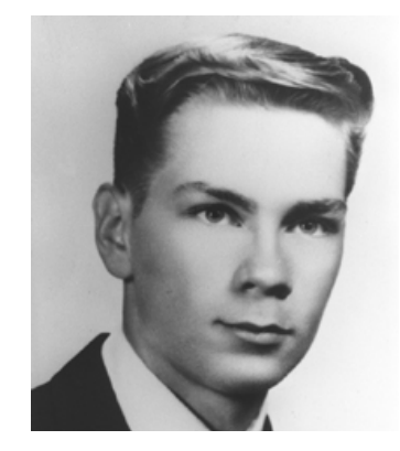
LaPointe - The U.S. Army Medical Department (AMEDD)

For conspicuous gallantry and intrepidity in action at the risk of his life above and beyond the call of duty. 14