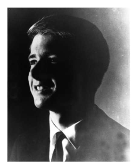
Bennett - The U.S. Army Medical Department (AMEDD)

For conspicuous gallantry and intrepidity in action at the risk of his life above and beyond the call of duty. <sup>10</sup>