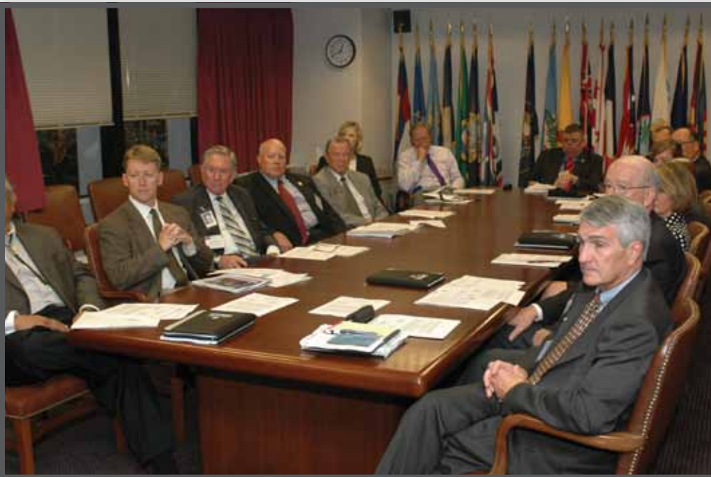
Chamber of Commerce Committee listening to presentation