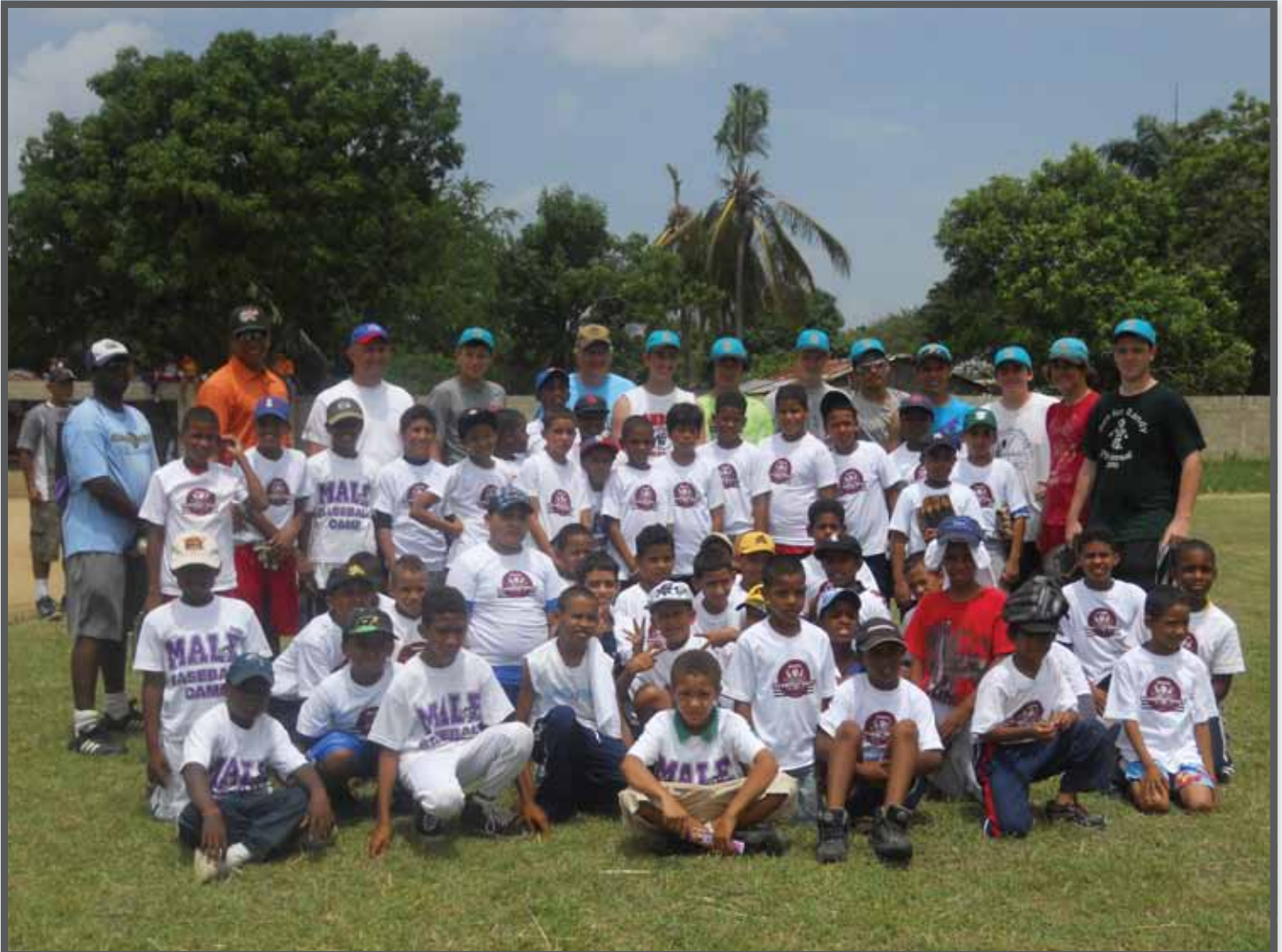
Youth Baseball camp in Santiago D.R., with G.O. Ministry Missionaries, Sidewinder team members, and young Dominican Nationals

When not busy volunteering and helping the local community, the Sidewinders were able to play competitive baseball games against local teams, including the best academy in the area and the Dominican Republic 16U National team which is scheduled to play in the Pan American games. They finished the week with three wins, three losses, all losses being a one-run differential. ■