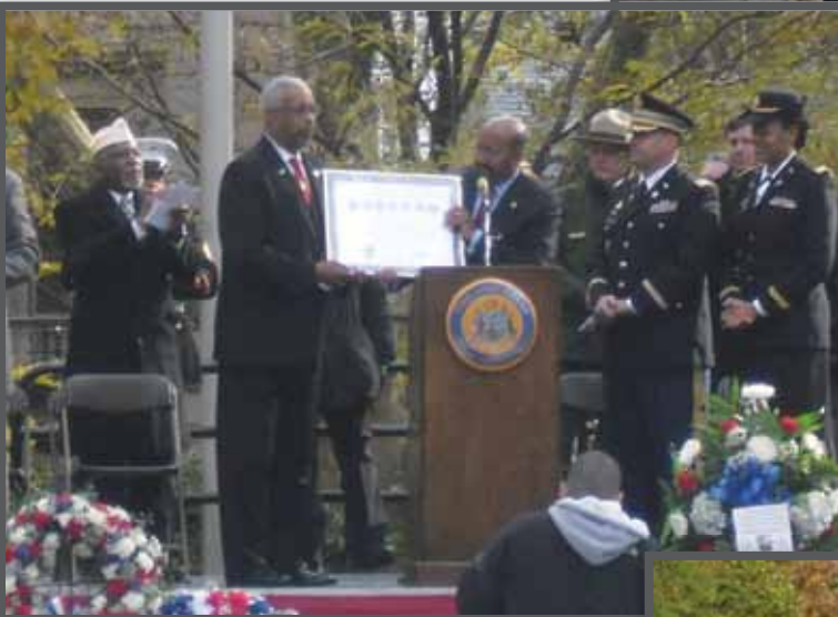
Mayor Nutter with the award